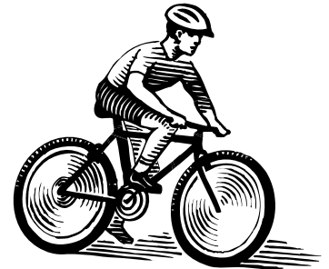
BIKE HIKE 6-27-06

Youth members of our parishes are invited for a 20-mile Bike Hike on Tuesday, June 27 th . We will ride to Deerfield and then bike along the Drumlin Glacial Bike Trail to Lake Mills. Destination: Mc Donald's and then a stop at the beach for swimming. Bring money for fast food. Return to Marshall before 5:30 PM by car. ADULTS ARE NEEDED. ANYONE planning to go is asked to sign up on the TEEN NEWS board in the church hallway. We will be biking with the teens from Holy Trinity. Meet on Tuesday, June 27 th at 12:30 PM at Holy Trinity's parking lot (by Marshall High school) with your bikes.